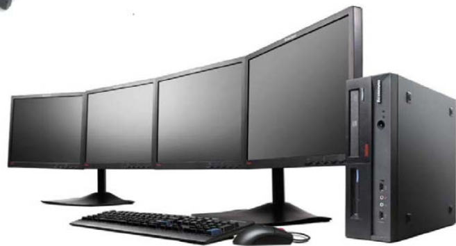
Lenovo ThinkCentre A62 Desktop with four Lenovo ThinkVision monitors