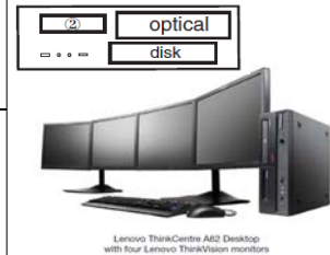
Lenovo ThinkCentre A62 Desktop with four Lenovo ThinkVision monitors